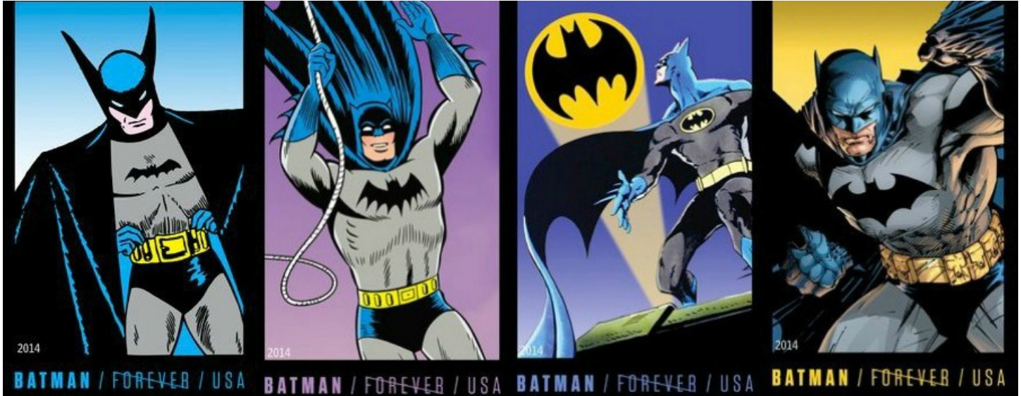
USPS 2014 issue of Batman commemorative stamps

In this assignment, you will demonstrate your grasp of the evolution of comics within the broader context of US social history by creating an original superhero figure and then assembling a “portfolio” that chronicles several major stages of her/his development from the Golden Age up to the present. Your portfolio must include the following three components, which can either be presented separately or merged into a single presentation (see note on “format” below):